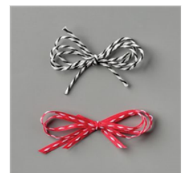
Playful Pets Trim Combo Pack - 152466