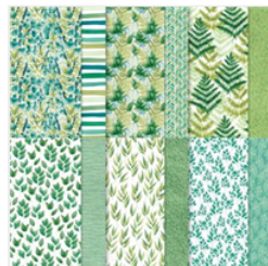
Forever Greenery Designer Series Paper - 152492