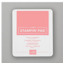
Flirty Flamingo Classic Stampin' Pad - 147052