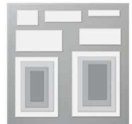
Rectangle Stitched Dies - 151820