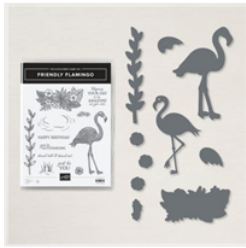
Friendly Flamingo Bundle - 156212