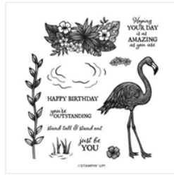
Friendly Flamingo Photopolymer Stamp Set - 154386