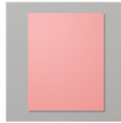
Flirty Flamingo 8-1/2 X 11" Cardstock - 141416