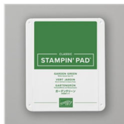
Garden Green Classic Stampin' Pad - 147089