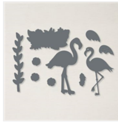
Flamingo Dies - 154313