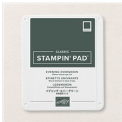
Evening Evergreen Classic Stampin' Pad - 155576