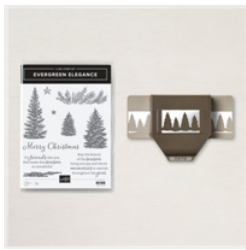
Evergreen Elegance Bundle (English) - 155579