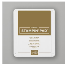
Soft Suede Classic Stampin' Pad - 147115