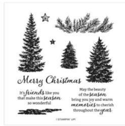
Evergreen Elegance Stamp Set - 153313