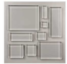
Clear Block Bundle - 118491