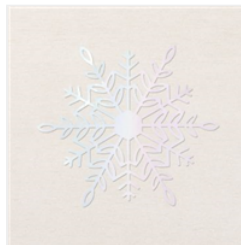
Wonderful Snowflakes - 156340