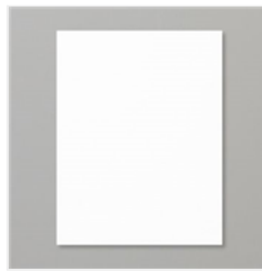
Basic White 8-1/2" X 11" Thick Cardstock - 159229